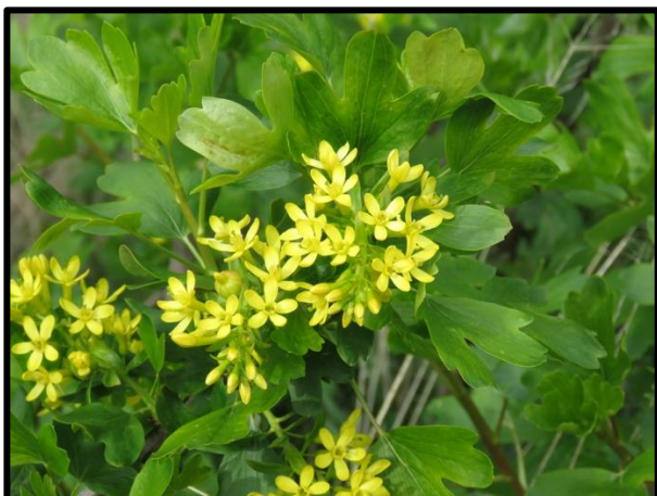
Golden current ( Ribes aureum ) is one of our region's earliest blooming native shrubs.

March-April The WRI Red Barn calendar is very full with guest authors, speakers, and films.