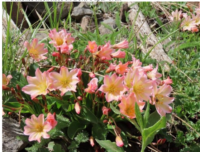
Wenatchee Rock Rose on Devil's Spur Trail

Are you one to take photos of a mystery wildflower and hopefully figure out what it is? Try using the University of Washington Burke Herbarium's easy-to-use key . You answer a series of basic questions (non-technical!) and a list of options is generated.