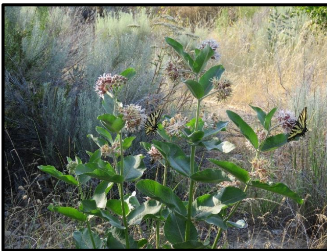
Showy milkweed at Coyote Dunes

Become a Western Monarch Milkweed Mapper . Western monarchs need our help - now more than ever. The Xerces Society, in collaboration with other researchers and biologists, is studying the mechanisms behind the critically low western monarch population, how the population fluctuates, and how to respond to the situation effectively. You can help us to build this knowledge by submitting sightings of monarchs (caterpillars, chrysalises, and adults) and milkweed to the Western Monarch Milkweed Mapper. You can submit data through the website linked above, or use the free Monarch SOS iOS app .