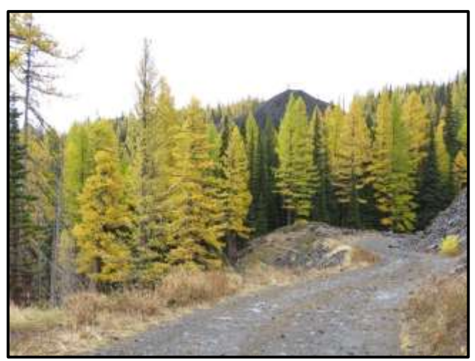
Late fall is a great time to take a hike to see western larch along the service road at Mission Ridge Ski area