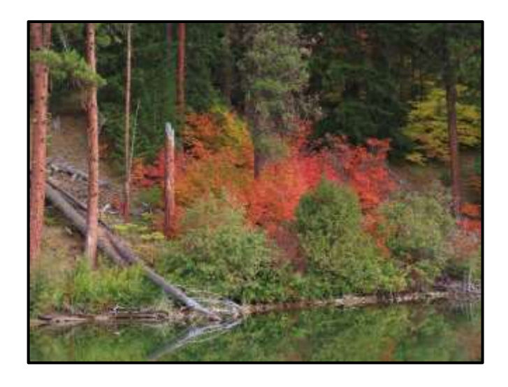
Fall colors along the shoreline of Fish Lake