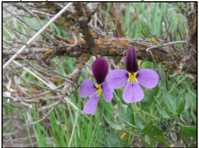
The late spring allowed me to see sagebrush violets ( Viola trinervata ) still blooming in late April in Douglas County.