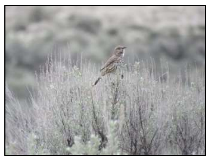
A singing sage thrasher on top of big sagebrush in Douglas County, late April 2019.