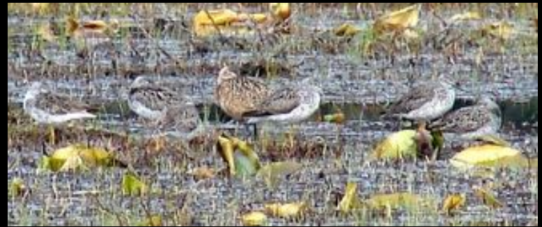
Lesser Yellowlegs at Fish Lake Bog UBB #3