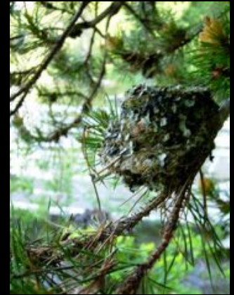
Rufous Hummingbird Nest At Lake Wenatchee UBB #5b 2009