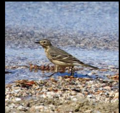
American Pipit