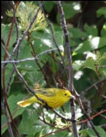
Yellow Warbler

"BIRDS, FORESTS, WATERWAYS - CONNECT & PROTECT"