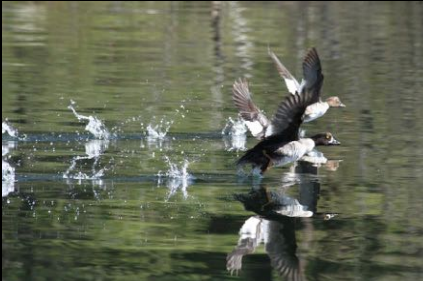
Scaups on UBB Survey © 5/1/2014 Tim Gallagher