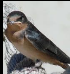
Barn Swallow 2009