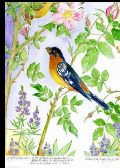
Grosbeak Rain Poster 2006 © H.A.W. Murphy