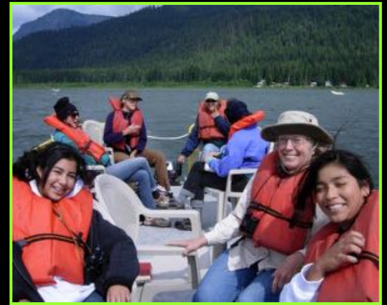
Birders -To -Learners