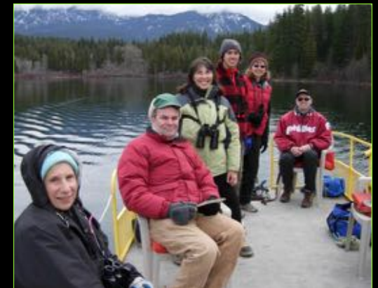
Upper Basin Birders