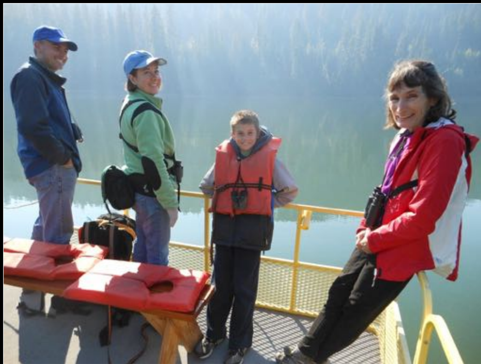
Upper Basin Birders VOLUNTEERS