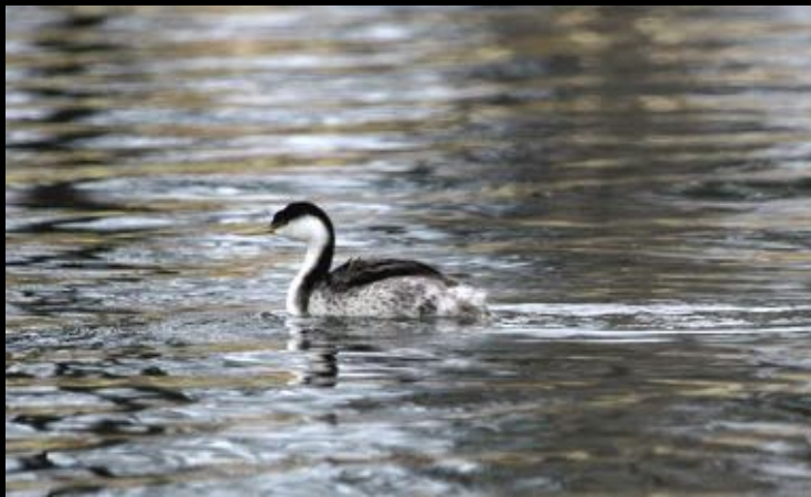
Western Grebe on UBB Survey © 11/3/2016 Tim Gallagher