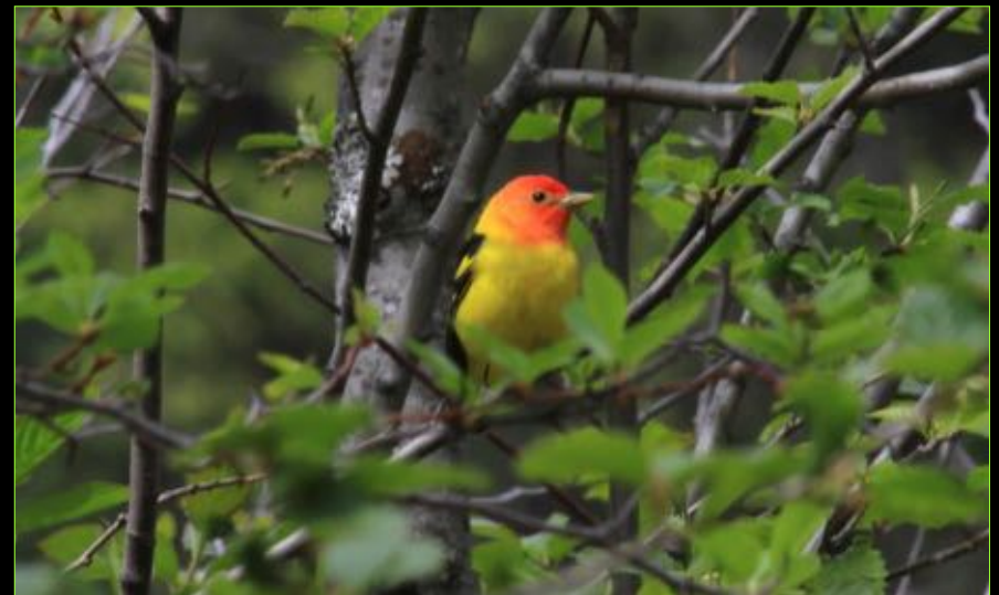
Western Tanager on UBB Survey © 5/20/2012 Tim Gallagher