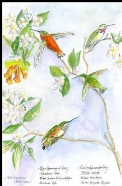
Hummingbird Four Poster 2008 © H.A.W. Murphy