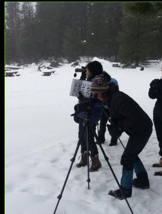
Lake Wenatchee State Park #5a Winter