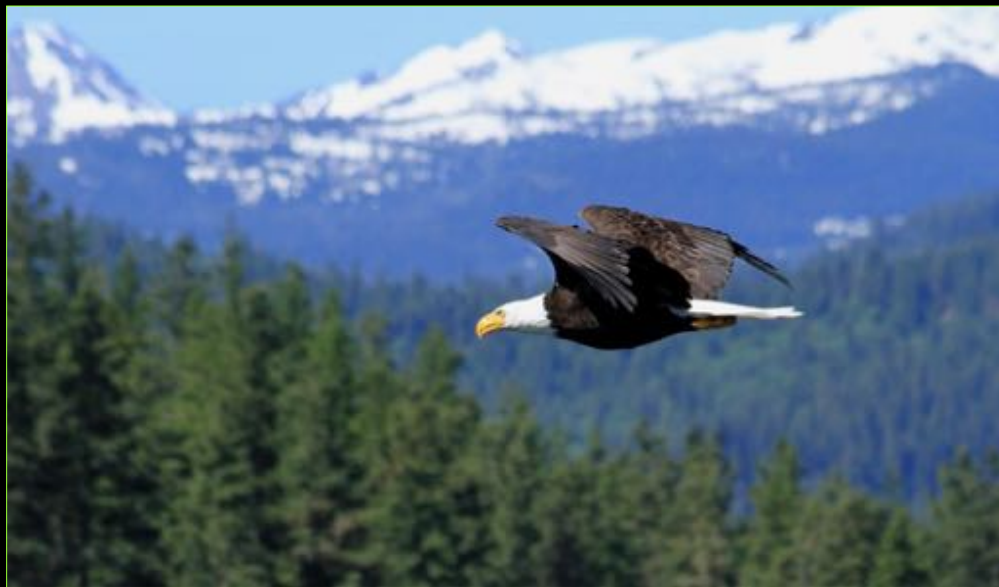
Bald Eagle on UBB Survey