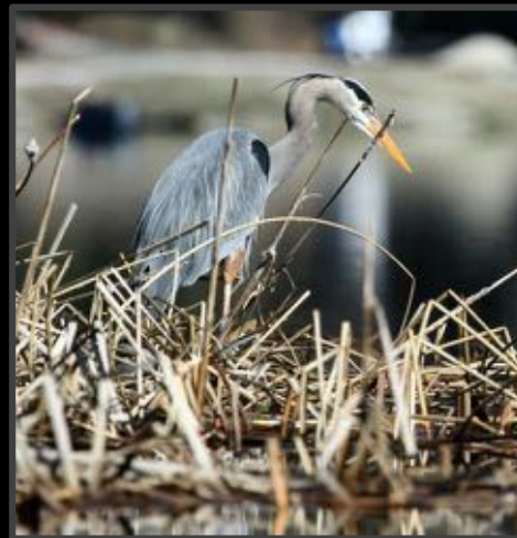
Great Blue Heron © 4/21/2017