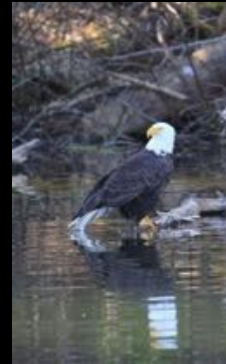
Immature Bald Eagles at Fish Lake UBB Station #2b