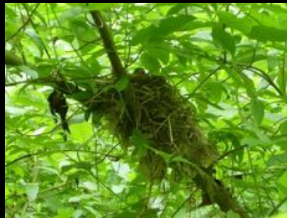
Swainson's Thrush Nest 2007