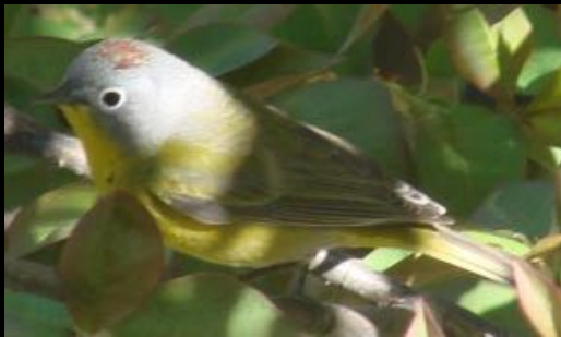
Nashville Warbler 2009