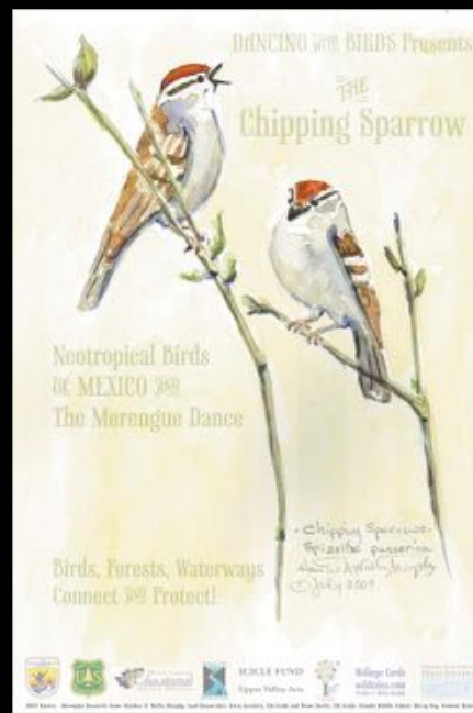
Chipping Sparrow Poster 2009 © Murphy & USFS