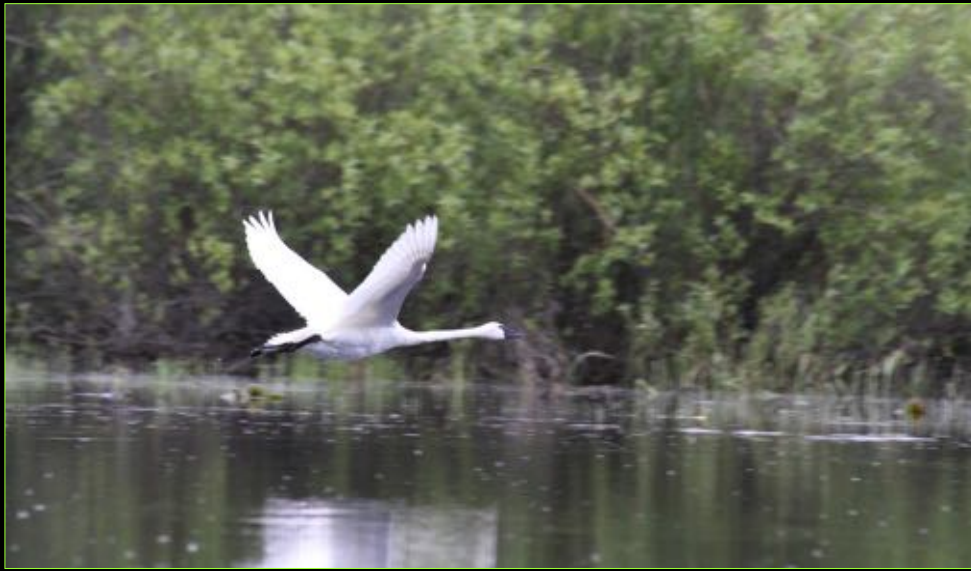
Trumpeter Swan on UBB Survey