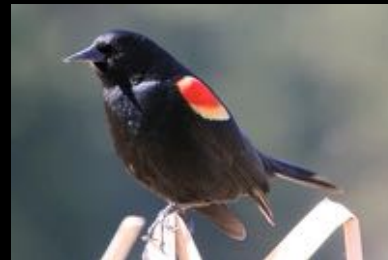
Red-winged Blackbird