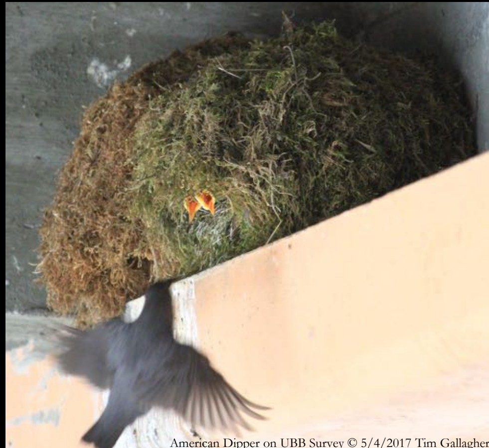
American Dipper on UBB Survey © 5/4/2017 Tim Gallagher

The Clark's Nutcracker needs White-bark Pine as well as other conifers. We are keeping an eye on the CLNU, which is most frequently seen between August and October.