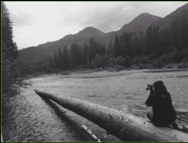
Napeequa Campground