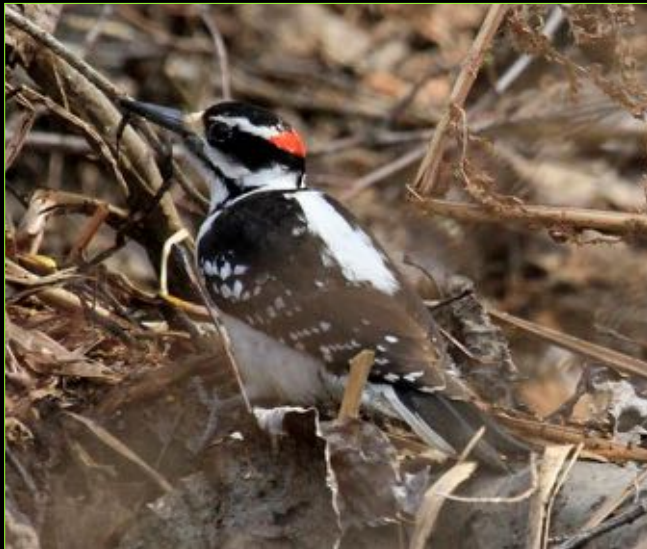
Downy Woodpecker on UBB Survey