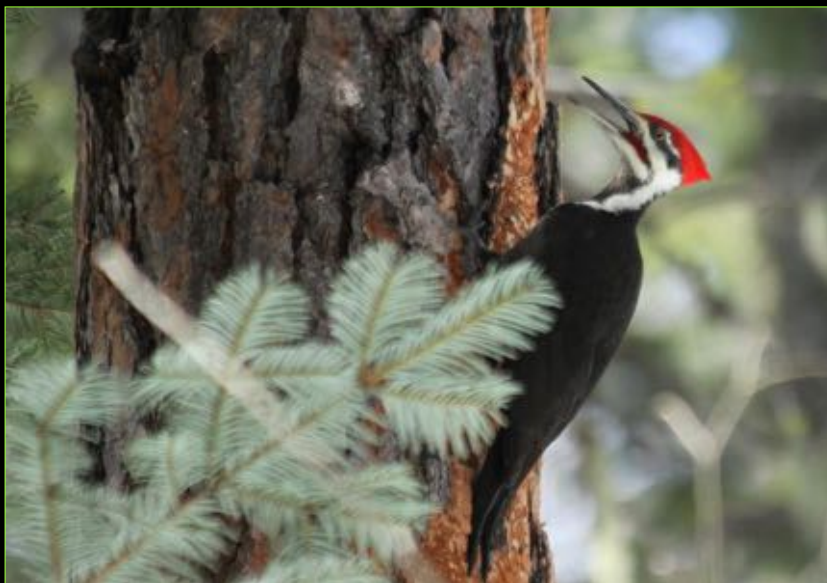
Pileated Woodpecker on UBB Survey