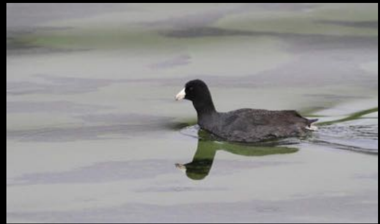
American Coot on UBB Survey © 11/1/2012 Tim Gallagher