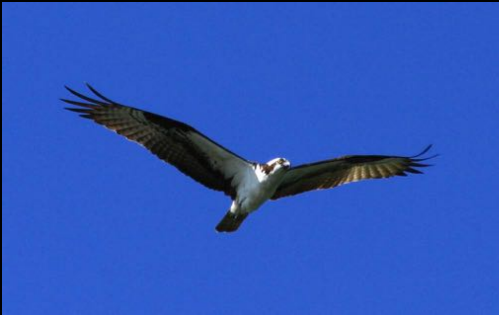
Osprey at Fish Lake UBB Station #2b © 7/3/2013 Tim Gallagher