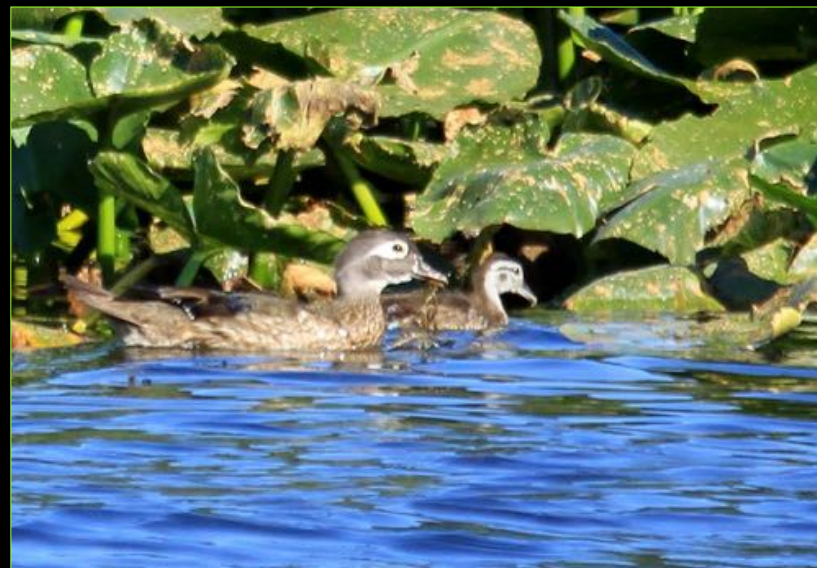
Wood Ducks on UBB Survey