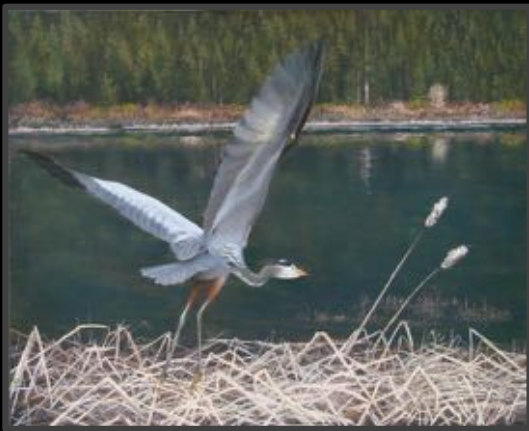
Great Blue Ascending © 2009