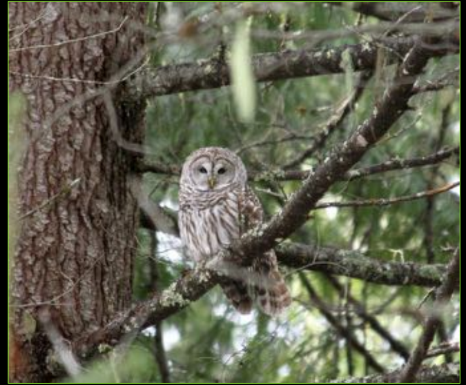
Barred Owl on UBB Survey