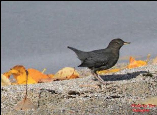
American Dipper on UBB Survey © 11/3/2016 Tim Gallagher