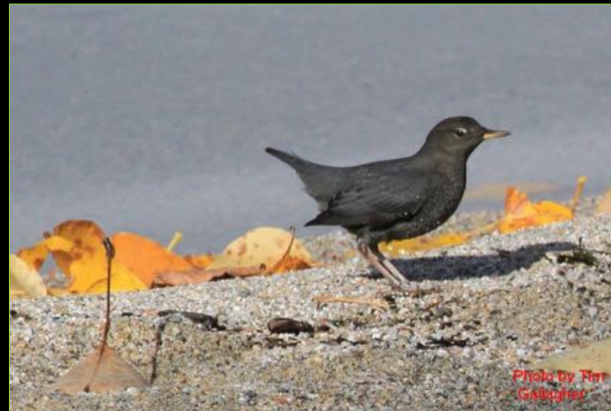
American Dipper on UBB Survey © 11/3/2016 Tim Gallagher