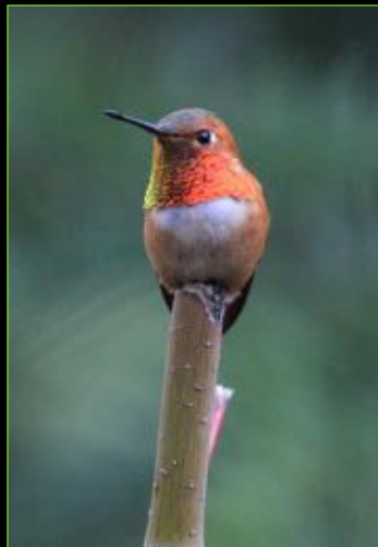
Rufous Hummingbird