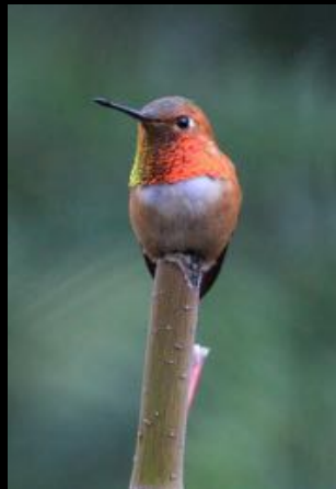
Rufous Hummingbird