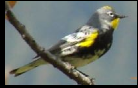
Yellow-rumped Warbler 2009