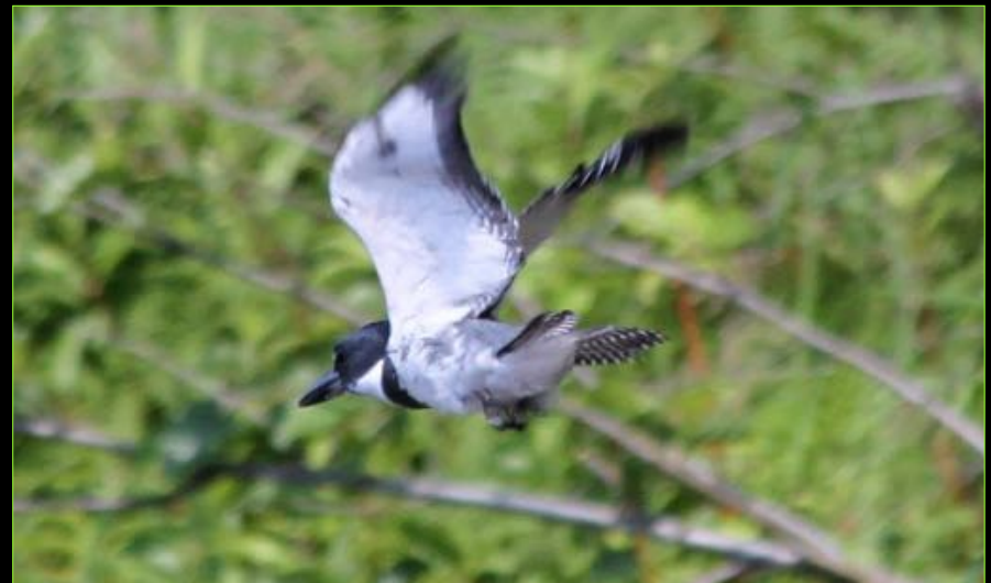
Belted Kingfisher on UBB Survey