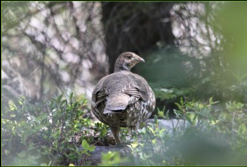
Sooty Grouse on UBB Survey