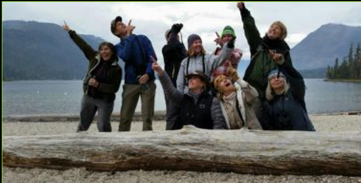
Lake Wenatchee State Park UBB#5a