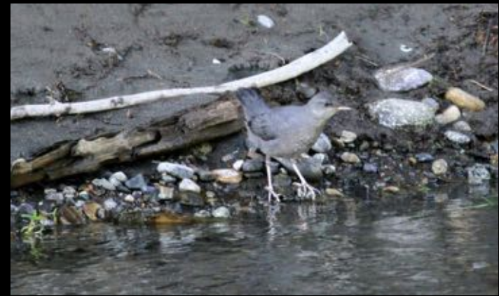
American Dipper on UBB Survey © 5/19/2017 Tim Gallagher