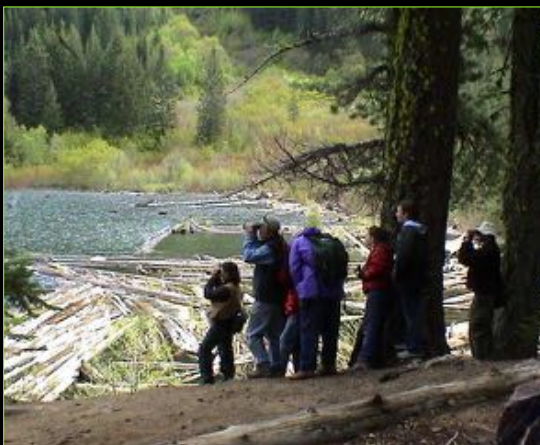
Twin Lakes Hike UBB #15