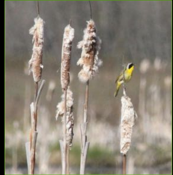
Common Yellowthroat on UBB Survey © 5/1/2014 Tim Gallagher