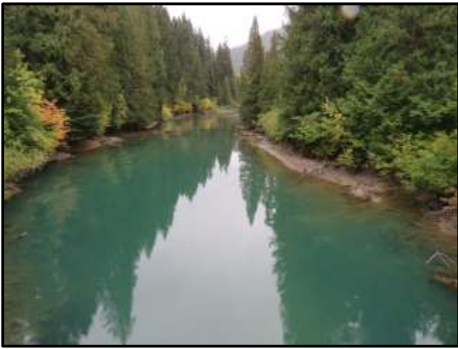
Looking downstream on the White River from Sears Creek Bridge. Glacial flour sediments from Glacier Peak give the river its milky hue.