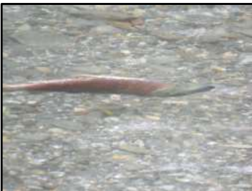
Sockeye salmon near Napeequa Crossing Campground, along White River, 9/24/16.