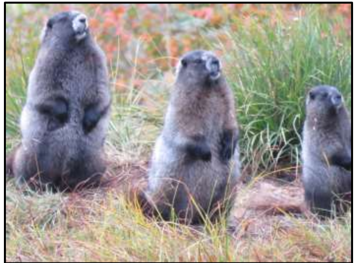
Family of hoary marmots along the Pacific Crest Trail at Sally Ann Lake, north of Steven's Pass. Their fat will be used during winter hibernation.