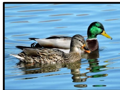
Mallard pair