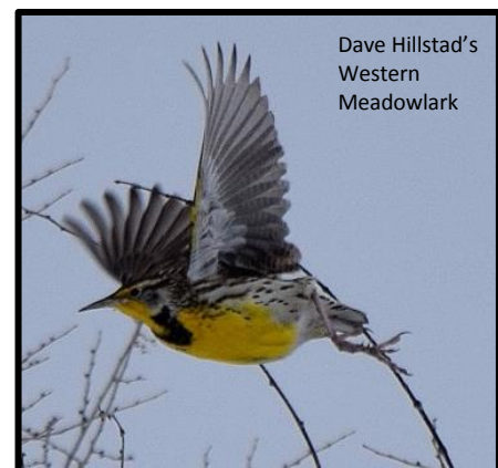
Dave Hillstad's Western Meadowlark

is looking for volunteers! The 14th annual Leavenworth Spring Bird Fest seeks volunteers. Help is needed to assemble guide packets, distribute programs, and staff tables at Bird Fest Central May 19th- 22nd. For more information: www.leavenworthspringbirdfest.com or contact Brook: programs@wenatcheeriverinstitute.org 509.548.0181 ext 4