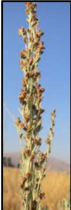
Flower buds appear brown